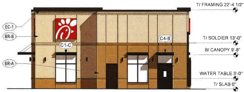
2 EXTERIOR ELEVATION 1" = 10'-0"