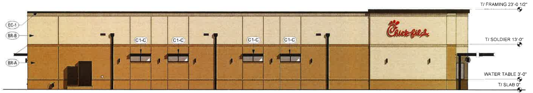
2 EXTERIOR ELEVATION 1" = 10'-0"