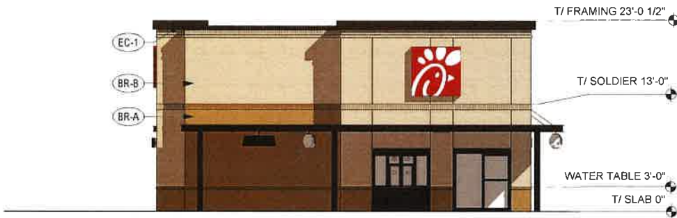
1 EXTERIOR ELEVATION 1" = 10'-0"