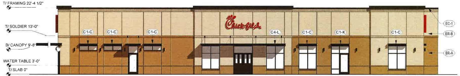
1 EXTERIOR ELEVATION 1" = 10'-0"