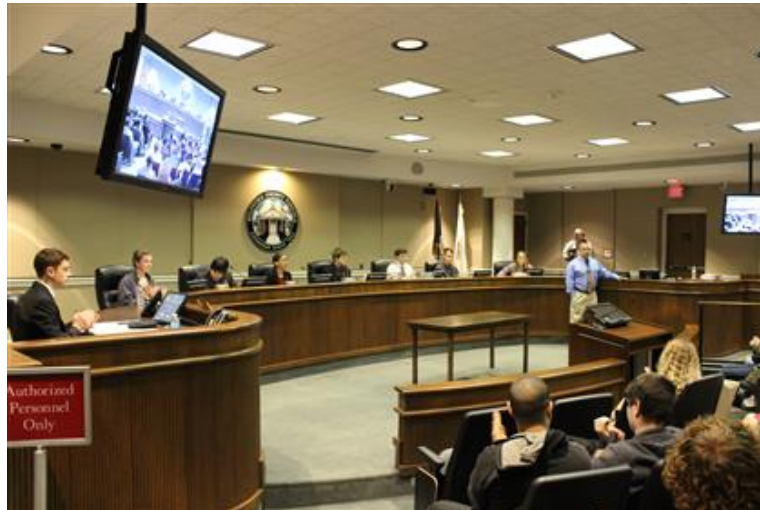
Student Government Day. Mock Board of Supervisor's meeting.

The County follows a series of policies and practices to guide the development of the annual budget. The application of these policies and practices promote a consistent approach to budgeting and assists the Board of Supervisors in maintaining fiscal stability and accountability.