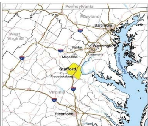
Stafford County in Regional Context

Established in 1664, Stafford County has a rich history from pre-colonial days to the industrialization of the nineteenth century. The County has important associations with major events and people in our nation's history. This history is documented by the County's bountiful archaeological and architectural remains. Stafford remained mostly a rural community until the construction of Interstate 95 during the late 1960s. Since that time, the County has experienced a growth rate that, for a period of time, ranked it among the fastest growing jurisdictions in the nation.