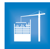
Community Development/Planning (CD)