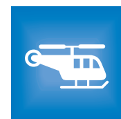
Military Operations (MO)