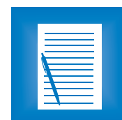
Virginia Legislative Initiatives (VL)