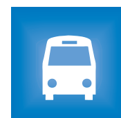
Transportation Systems (TS)