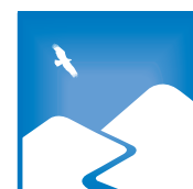
Environmental/Conservation/Open Space (EC)