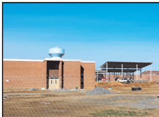
Grafton Village Elementary