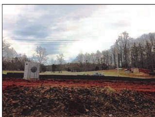
Work on Mountain View Road