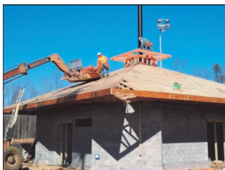
Chichester Park Concession Building