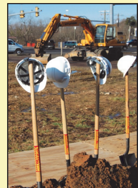
Falmouth Intersection Groundbreaking