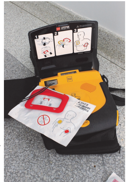
AED on the Third Floor of the Government Center

Stafford County has AEDs in visible locations in government buildings, schools and parks. Each school has anywhere from two to five AEDs. In the parks, AEDs should be visible from the walkways and are marked on any park maps. Take a moment to familiarize yourself with the location of AEDs. You just might save a life.