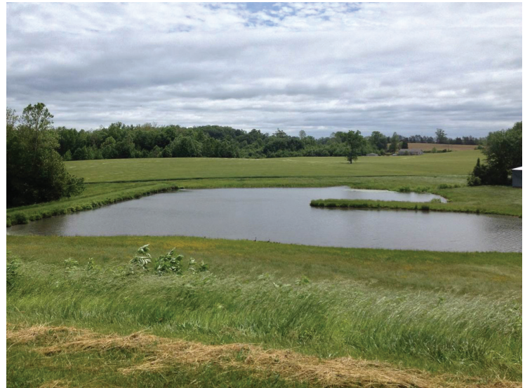
The 100-acre Historic Spotted Tavern Farm in Hartwood is new to the PDR Program.

and development in areas where infrastructure already exists, Stafford is able to better control the impact of new residents and students on schools, roads and the environment.