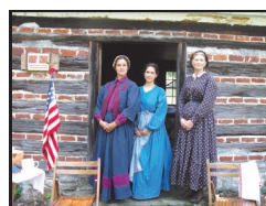
Falmouth Historic District