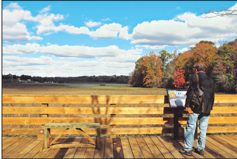
The boardwalk at Government Island, birthplace of the stone used in the building of the U.S. Capitol and the White House

Did you know that Aquia Landing Park, site of a serene park on the Potomac River, was once a bustling steamship wharf and the Richmond, Fredericksburg and Potomac Railroad terminus? 150 years ago, this wharf brought in more than one million tons of food and supplies daily. It is the same port where thousands of enslaved people self-emancipated, including one of the most famous freedom seekers, Henry "Box" Brown. Brown hid in a wooden crate and mailed himself to freedom in Philadelphia. It is a stop on the National Underground Railroad Network to Freedom, a program that preserves Underground Railroad sites. In addition, Aquia has a series of Trail to Freedom (a local program to commemorate slaves who passed through this area seeking freedom) and Civil War informational signs,