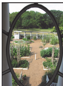
George Washington's Boyhood Home at Ferry Farm