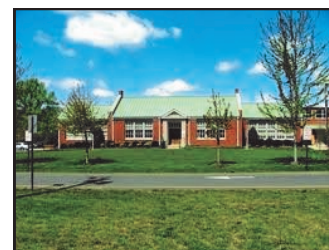
Stafford Training School (Rowser Building)

Stafford County has a total of 21 properties listed on the Virginia Landmarks Register and National Register of Historic Places. Photos of five of them are shown here. For a complete listing, please visit the National Park Service Website at www.nps.gov/nr/ .