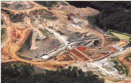
Rocky Pen Run