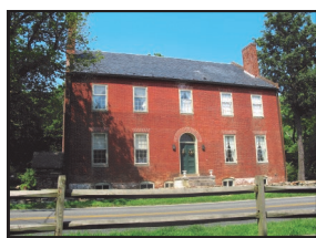
Moncure Conway House