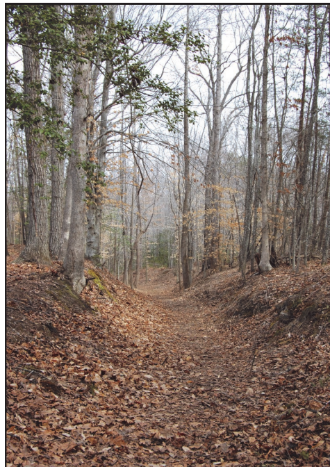
The Potomac Church Road bed that led from Potomac Church to the Stafford Courthouse area

allowing visitors to imagine what the landscape was like two centuries ago.