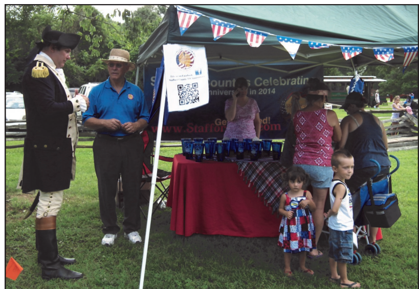
Stafford's 350th Anniversary Booth has been making the rounds in 2013, including visiting the July Fourth celebrations at Ferry Farm this summer.

There are many opportunities for sponsorships including several major events (see box at left) and programs that will take place year round. For details, visit www.Stafford350.com