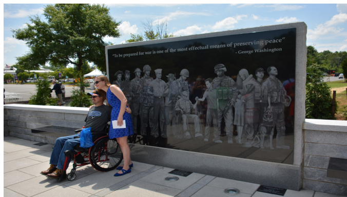
A veteran poses with the centerpiece of the memorial, an etching depicting armed service members throughout history.