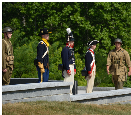
Members of the Third Infantry Old Guard dressed in period costume and saluted each other during the ceremony.