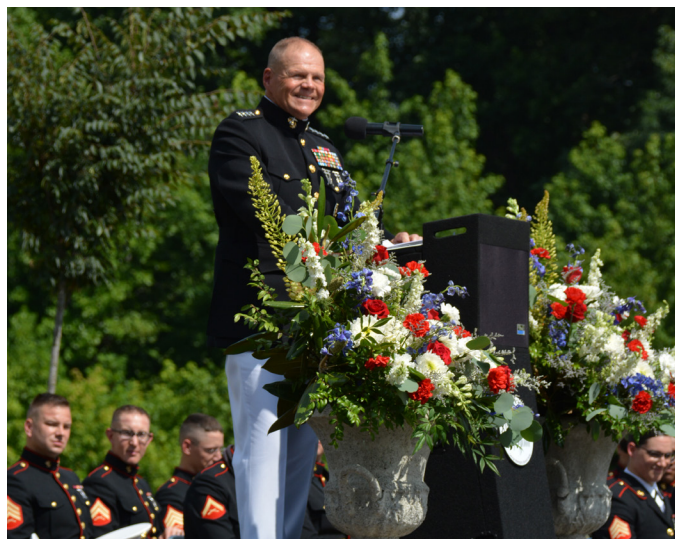
The 37th Commandant of the Marine Corps, General Robert B. Neller, addresses the crowd.