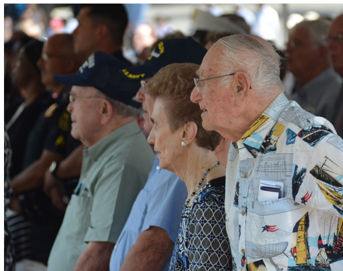
World War II veterans stand to be acknowledged during the WWII marker salute.