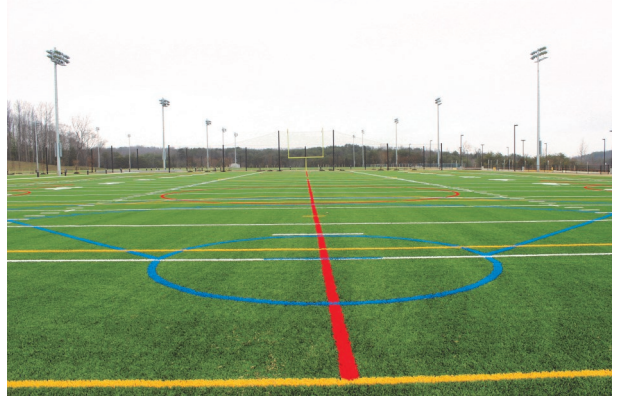
Artificial Turf Field

The Jeff Rouse Swim and Sport Center is scheduled to open in March of 2016. The center features a 50 meter X 25 yard competition pool, cool-down pool, therapy pool, exercise room, aerobics room, basketball courts, classrooms, nursery and a snack bar. Patrons must join the center to participate in the sports leagues and programming. The facility is owned by Stafford County but is being managed by Eastern Sports Management in a public-private partnership. For more information about membership, visit www.rousecenter.com or call the Rouse Center at (540) 318-6332.