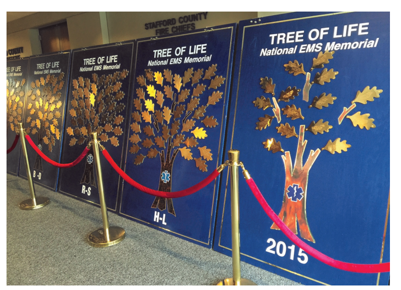
The National Emergency Medical Services Memorial is currently on display in the lobby of the Ford T. Humphrey Public Safety Building, 1225 Courthouse Road. The memorial honors EMS workers who have died in the line of duty.