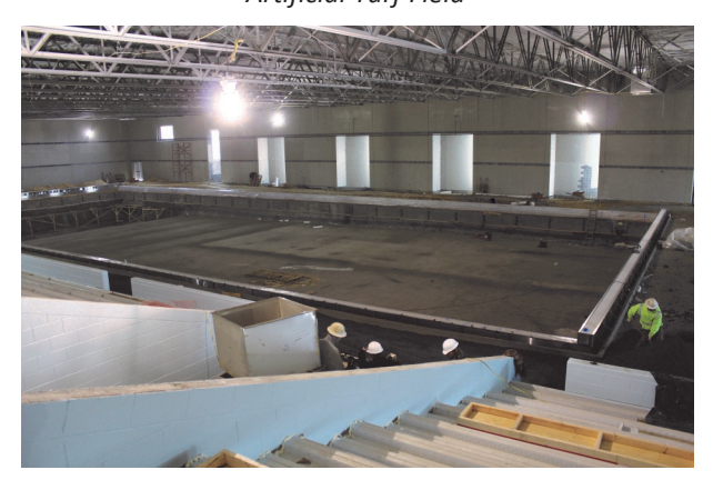
50 meter X 25 yard competition pool