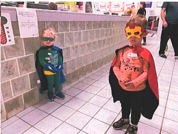
Preschool Halloween Party 2019!