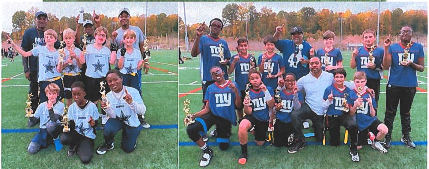
NFL Flag Football Champs