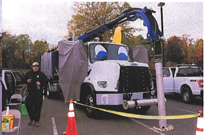
Trunk or Treat